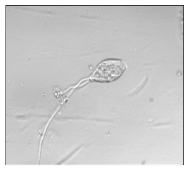
Figure 1. Ciliate from the genus Vorticella

The study presents the analyses of the microbial composition of municipal wastewater from two objects that use the biological treatment process: the wastewater treatment plant located in the motorway rest area, equipped with a tank with a submerged biofilter and a municipal sewage treatment plant that uses a hybrid circulationflow reactor and a hydroponic lagoon as the third stage of treatment.